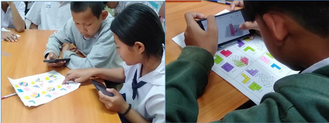
Figure 3. Students learn in the classroom using GeoGebra™ on their mobile phones.

In Figure 3 below, there are two photos showing students learning together, using the GeoGebra application on their mobile phones.